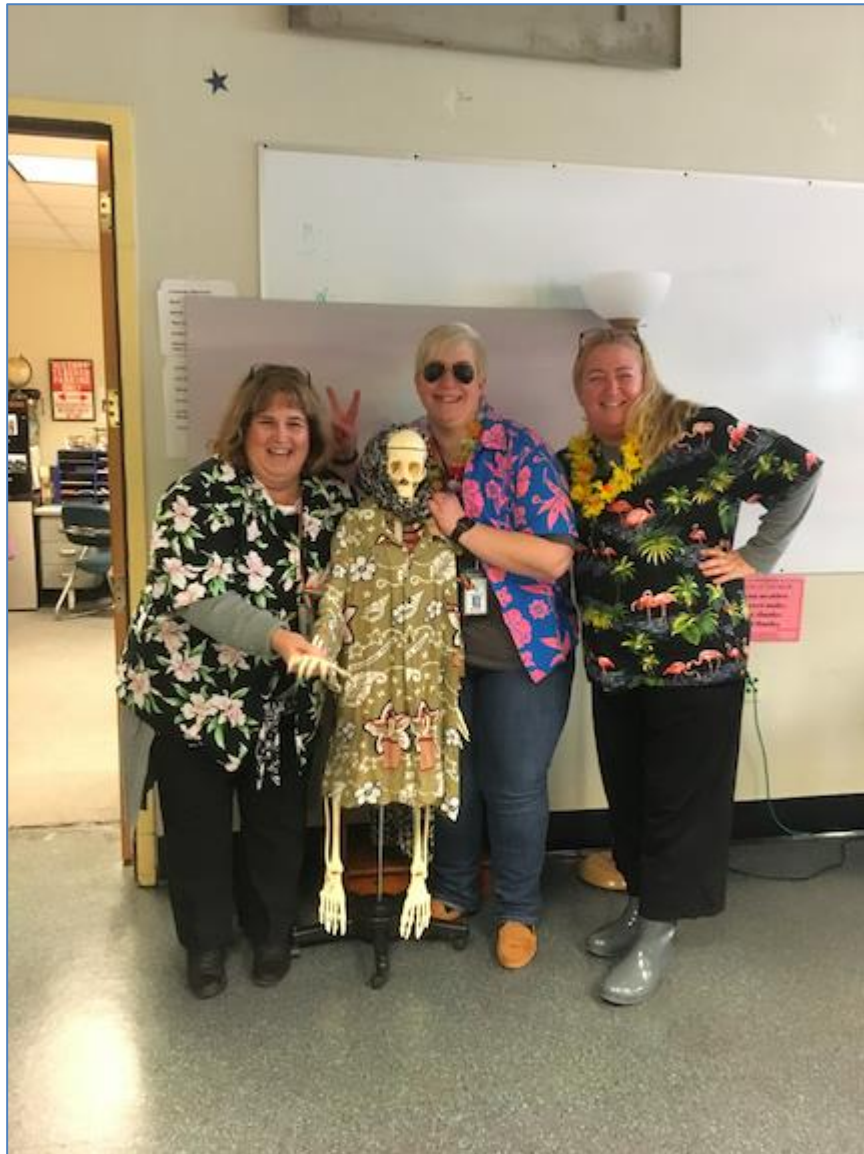
Enjoying Beach Day during LHS Spirit Week on Friday, November 16th.