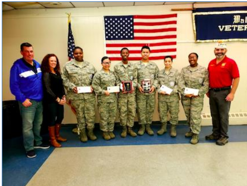
Above are the winners from this year's Voices of Democracy contest the VFW has each year.

After 2 hours of back-to-back basketball, our team was exhausted but proud! You rock, LHS Unified.